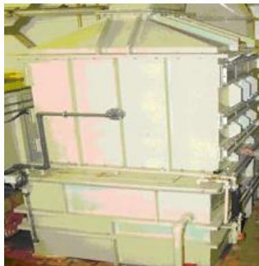
Fig. 4 Foam absorber

In order to eliminate the discharge of aerosols and vapours from etching baths and activation in the new equipment C 93, install the foam absorber shown in Figure 4.