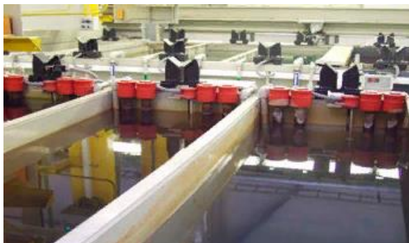
Fig. 3 System of three-stage washing of parts

In the new equipment of Ts 93 and MCIQ-3 there are systems of three-stage washing of parts, which allows to reduce the amount of water used for washing. Figure 3 shows the system of three-stage washing of parts.