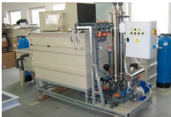
Fig. 2 Microfiltration installation

In order to reduce the load on the treatment facilities and reduce the discharge of petroleum products into the sewerage system, as well as the rational use of degreasing solutions, it is proposed to purchase the microfiltration plant shown in Figure 2 in all workshops. Such installations will reduce the discharge of degreasing solutions by three times and extract up to 90% of oil products.